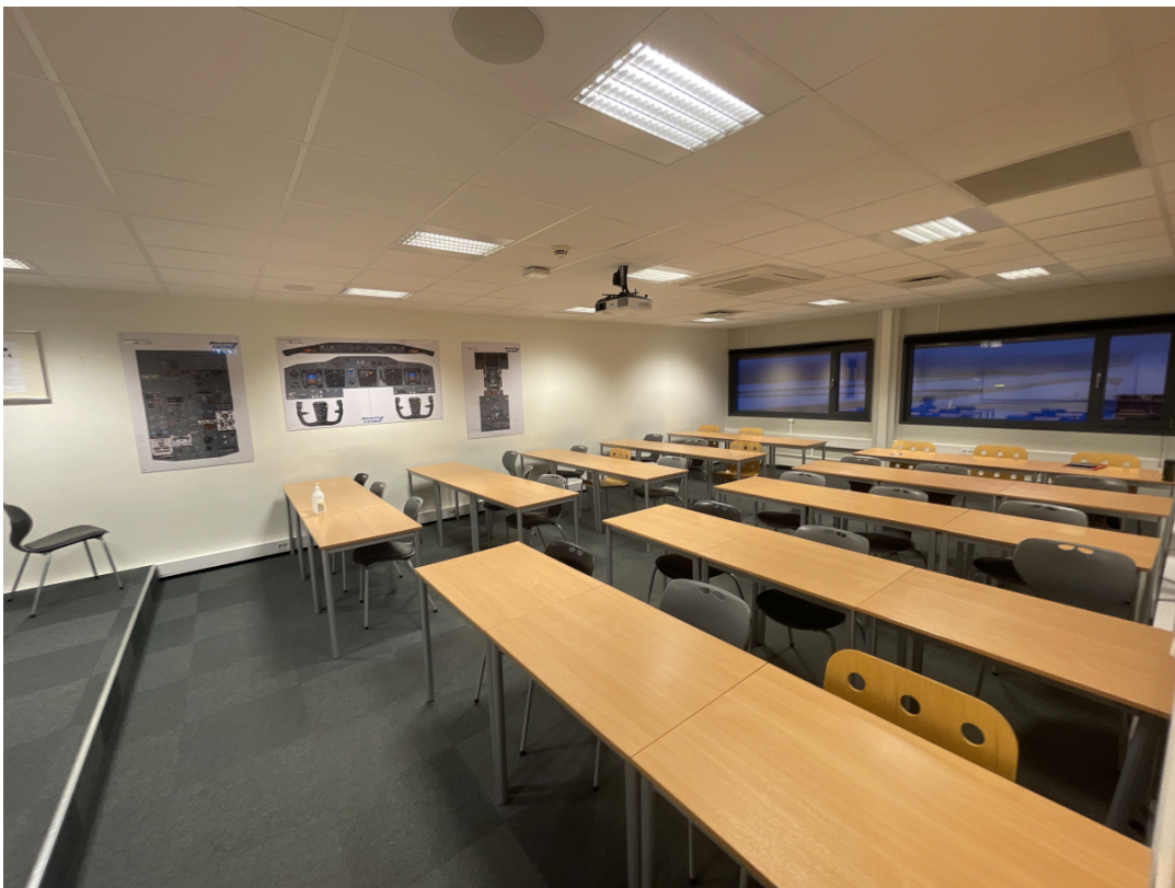
This last picture is a bit distorted as it's taken with wide-lens, the measurements are correct. The seating arrangement might be different than pictured.